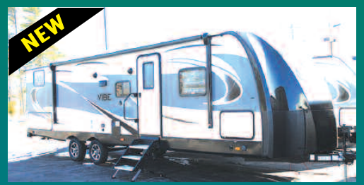
2019 Vibe 284 BHS Travel Trailer Power jack, slideout, power awning. MSRP $38,982. SALE PRICE $29,900 AS LOW AS $229 A MONTH

2018 Cherokee Grey Wolf 26 DBH Travel Trailer Bunkhouse, slideout. MSRP <u>$26,895.</u> SALE PRICE $19,995 AS LOW AS $199 A MONTH