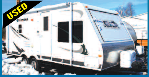
2010 Palomino Stampede S-238 Travel Trailer Expandable, Slideout, Front & Rear Tent End Beds. Regular $10.999.

2013 Catalina Deluxe Edition 31RLS Travel Trailer Sleeps 8, slideout, Regular $17,900. SALE PRICE $15,995 AS LOW AS $139 A MONTH